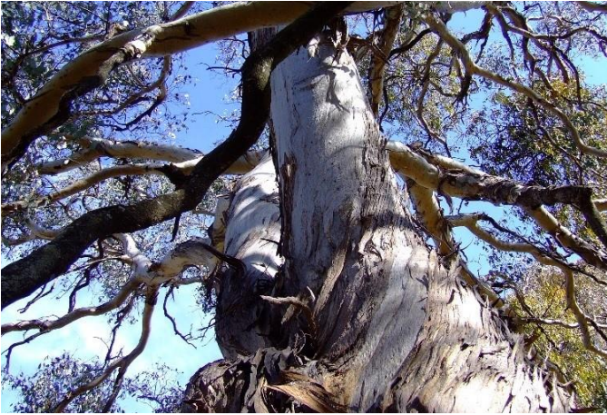
Perfect superb parrot habitat - a hollow-bearing tree in Boorowa.